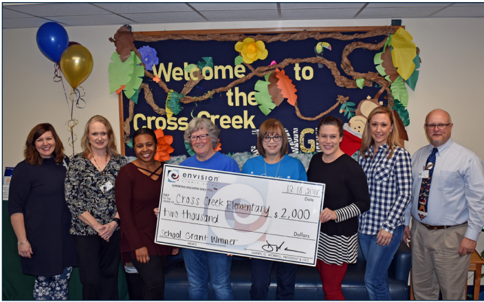
Cross Creek teachers and administrators display the $2,000 check from Envision Credit Union for the school's outdoor classroom.

A desire to make a functional outdoor classroom a reality fueled some teachers' interest in applying for a grant from Envision Credit Union. Envision recently awarded a $2,000 grant to Cross Creek Elementary School that will give teachers and students the opportunity to engage in lessons across the curriculum and conduct experiments in an outdoor environment that is conducive to hands-on activities.